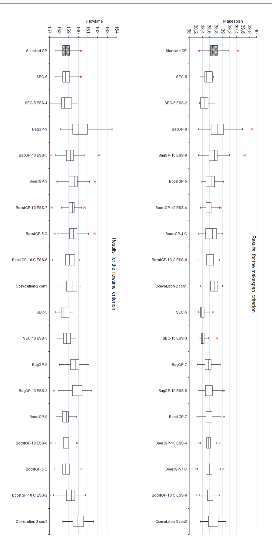
Fig. 3: Box plot representation of results Fig. 4: Box plot representation of results for the Ft criterion for the Cmax criterion